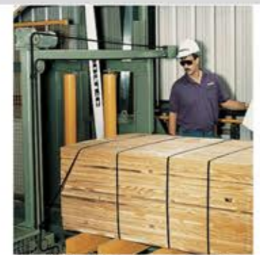
Available with strapping unit as an option