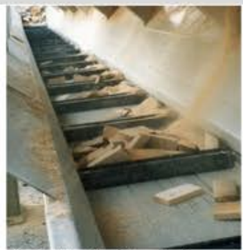
Available with integrated waste conveyor

Subject to technical amendments. All dimensions without commitment.