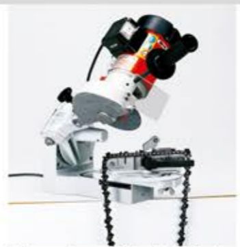
Sharpening unit included in the scope of supply