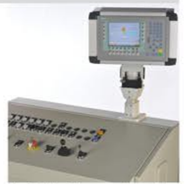
Available with several control options

As perfect solution for cutting packages to fix lengths HOLTEC offers the package crosscut station type SHK: with moveable package carriage and stationary saw unit. High cutting accuracy and a solid construction distinguish this machine. With this saw you can carry out multiple cuts within one package absolutely clean and precise.