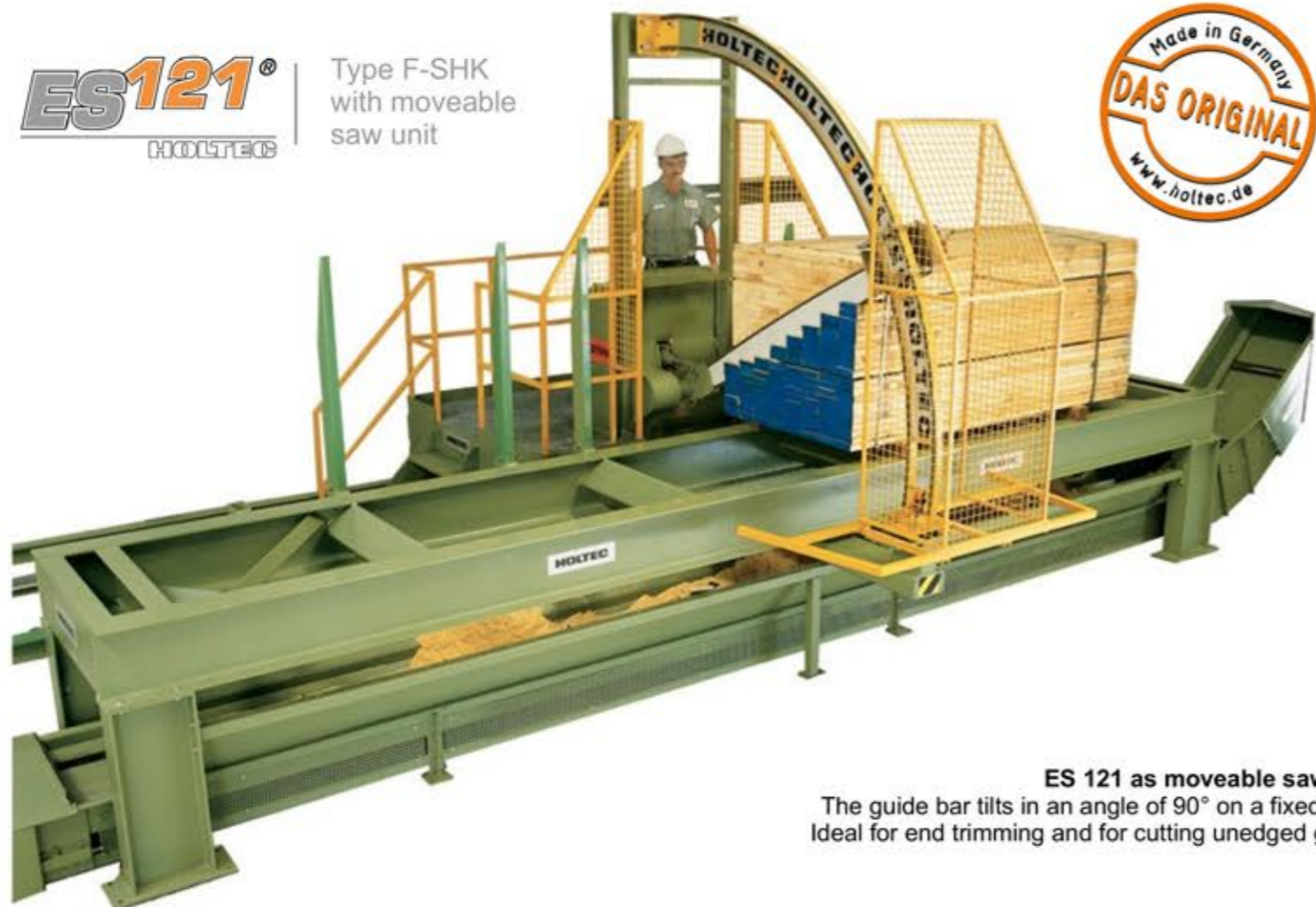
ES 121 as moveable saw unit The guide bar tilts in an angle of 90° on a fixed pivot Ideal for end trimming and for cutting unedged goods