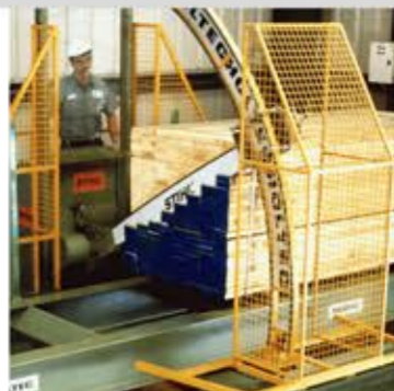
CE-conform protection devices