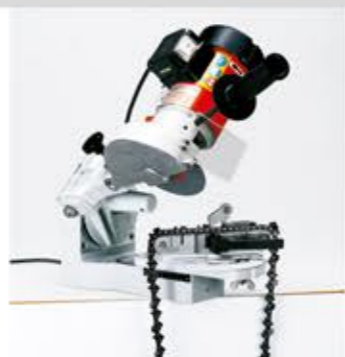
Universal sharpening unit included in the scope of supply