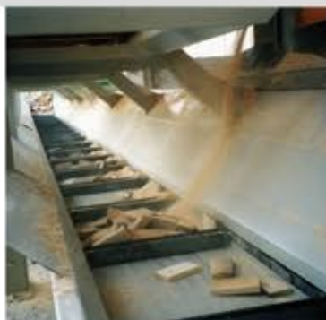
Available with integrated waste conveyor