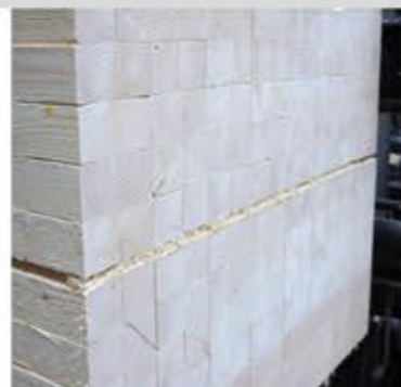
Smooth cutting surfaces

The ES 121 FSHK is the simplest solution for precise end trimming also of unedged timber and of timber packages which are stacked with gaps. By means of the moveable saw the packages remain in their loaded position and are cut to length with highest precision. These systems are also perfect for customers with limited space.