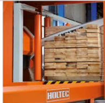
Variable cutting angle of 0 to 15° for optimal distribution of the cutting forces

Subject to technical amendments. All dimensions without commitment.