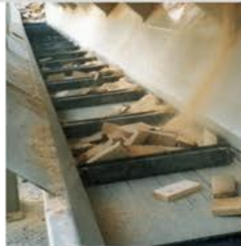
Available with integrated waste conveyor

The Vario-Cut series is especially designed for the needs of high-capacity operations. A rugged saw unit, a vertically running guidance of the guide bar and the possibility of the variable guide bar control during the cutting process characterize this machine type. Equipped with 15-kW drive for short cycle times during cutting process and high capacity.