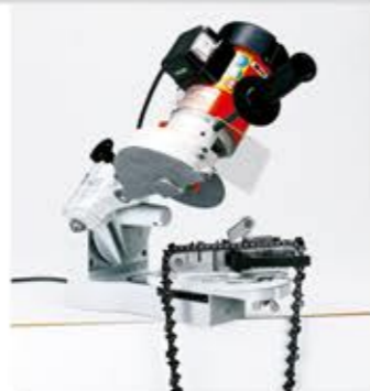
Sharpening unit included in the scope of supply