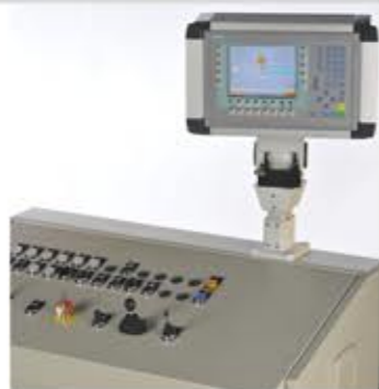
Available with several control options